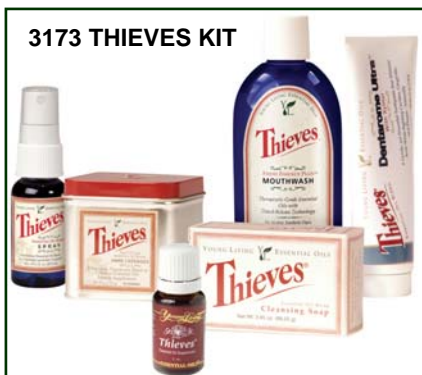
3173 THIEVES KIT